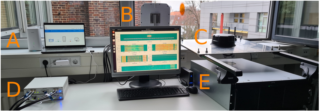
Fig. 1. Experimental setup with direct line of sight to the mobile tower indicated by the ellipsis. A) Laptop serving as DICOM client connected to 5G antenna B) directional antenna C) omni-directional antenna D) USRP devices E) Host-PC. During experiments, the client setup (A) was placed several meters away from the remaining setup to avoid interference and windows were opened to simulate a medical scanner being provided on a mobile trailer.

the open-source software library DCMTK 1 . We connect the laptop using Ethernet cable to a HUAWEI 5G CPE Pro 2 (Balong 5000 chipset; theoretical 5G transmission rates: 3.6 Gbit/s (downstream), 250 Mbit/s (upstream); Huawei Technologies Co, Shenzhen, China; Fig. 1:A) which provides 5G access via an off-the-shelf internet data plan for business customers with unlimited volume ( Business Mobil XL Plus , Deutsche Telekom AG, Bonn, Germany).