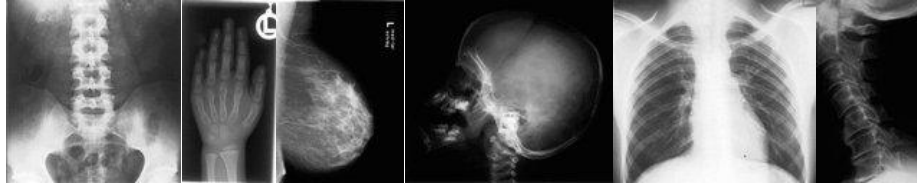
Figure 2. Example images (IRMA). Left to right: abdomen, limbs, breast, skull, chest, spine.

used here to obtain an efficient approximate search that can easily cope with very large sets of reference vectors at significantly lower runtime.